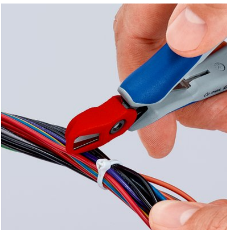
Easy attachment: the material catcher is easily attached and fastens securely to the pliers head