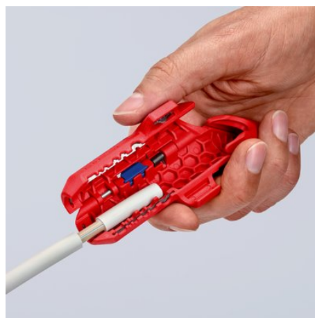
Stripping of a NYM cable