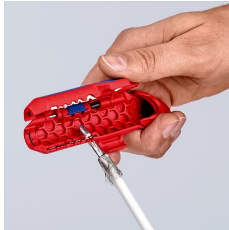
Stripping of a coax cable