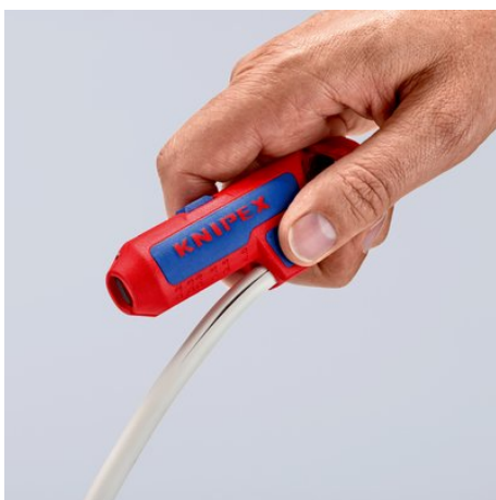
With concealed cutter in overhanging thumb rest on the side for convenient lengthwise cut