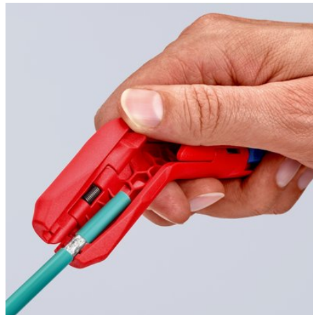
Stripping of a data cable