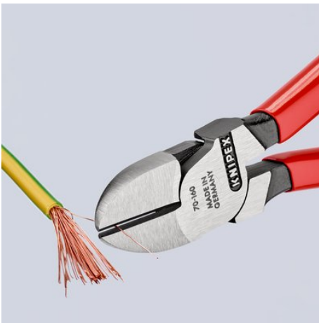
Clean cutting of thin copper wires, also at the cutting edge tips