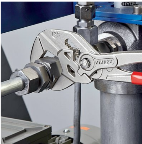
replaces the need for sets of metric and imperial spanners