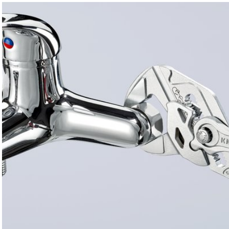
Working on plated fittings without damage of the surface