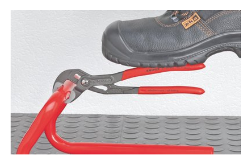
Teeth set against the direction of rotation have a self-locking effect and prevent slipping on the workpiece.