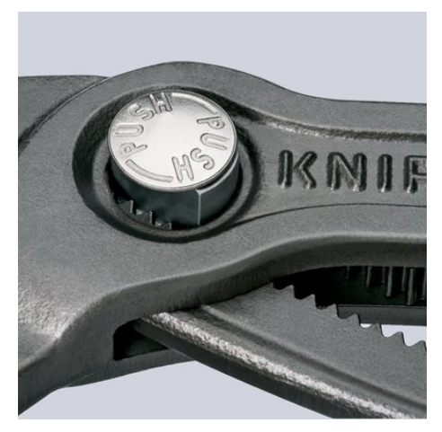
Fine adjustment by pushing a button: fast and comfortable.