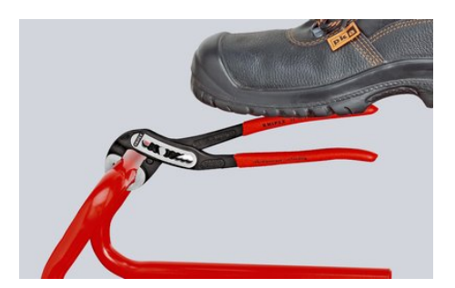
Self-locking on pipes and nuts: no slipping on the workpiece; the complete actuating force can be used to turn the workpieces; not having to squeeze the pliers handles reduces the required effort