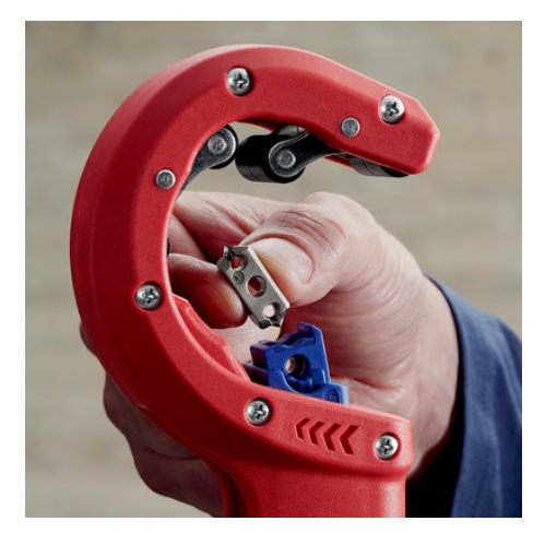
When worn, the blade can be reversed or replaced without the need for tools