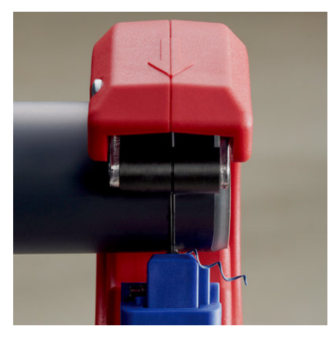
Segments as short as 10 mm can be cut. The spiral chip comes from chamfering.