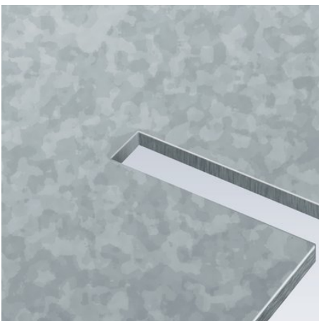
Notching and chip breaking in a single pass