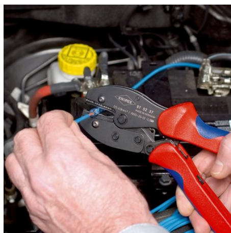
97 52 37