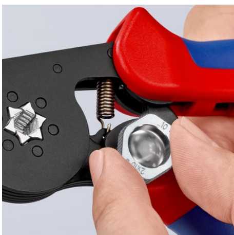
The crimping pliers can be adjusted to large wire ferrules of 16 mm 2 or 2 x 10 mm 2 with the adjusting wheel.