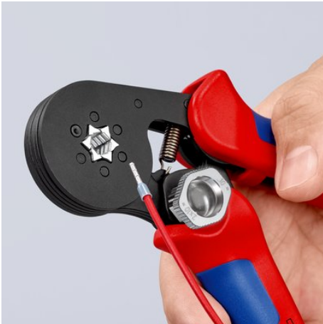
Suitable for fine conductors: crimps fine conductors from 0.08 mm 2