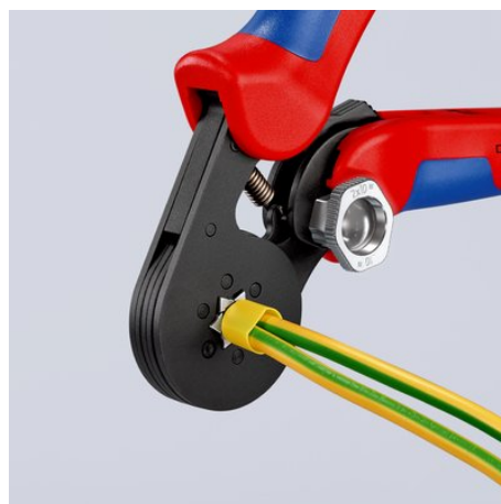
Also suitable for twin wire ferrules: capacity up to 2 x 10 mm 2