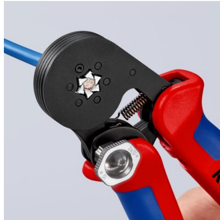
Enormous capacity: crimps single wire ferrules up to 16 mm 2 or twin wire ferrules up to 2 x 10 mm 2