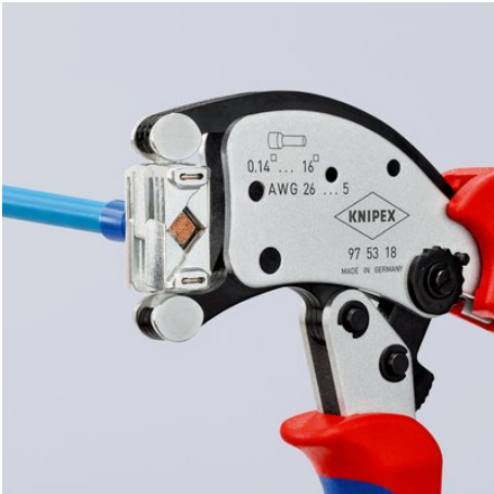
Uniquely flexible: connectors can be inserted in the rotatable crimp head from almost any position